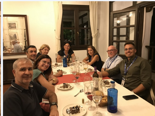
FEPS dinner at the Carmen della Victoria